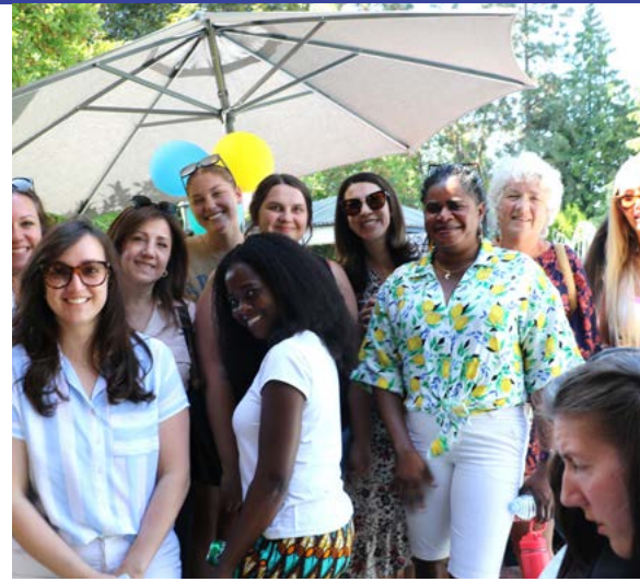
Celebrating three decades of Bethesda in the Okanagan. With the support of generous donors, we're expanding our reach—strengthening families, building community, and creating meaningful relationships that last.

If you're in the Kelowna area, you will be seeing more of us. We are planning another Bethesda event this summer and intend to make it an annual gathering that reinforces relationships and signals the importance we place on families in the region.