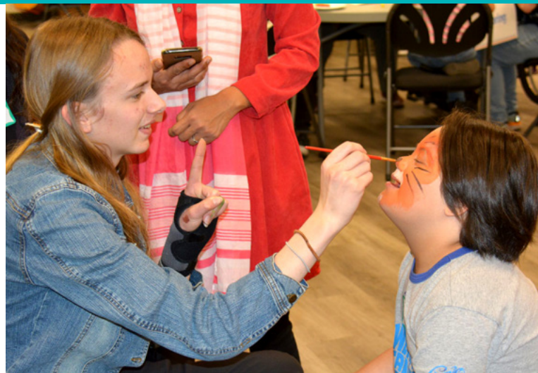
Families participated in the many activities offered at the Family Fun Evening in October: face-painting, jenga, animal-shaped balloons, crafts, lego building, and unstructured play time in a safe and accepting space.

Visit and subscribe to our YouTube channel, Bethesda Christian Association, and watch the Family Fun Evening video .